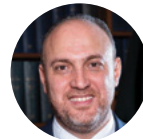
HUSAM S. ZOMLOT