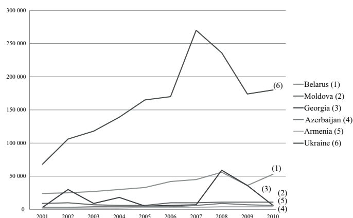
Chart 1: Trends in the total trade between Slovenia and the countries of the Eastern Neighbourhood

With respect to the consistency of the direction of Slovenia's development assistance, the annual reports of the Ministry of Foreign Affairs about the ODA distribution between 2006–2009 show mixed results (Table 3 below).